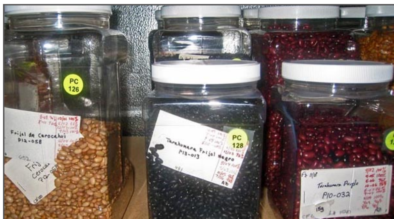
Beans in our new walk-in coldroom; these particular samples are used for distribution purposes. From left: Frijol de Cerocahui, Tarahumara Frijol Negro, and Tarahumara Purple.

With the hope of making more complete use of our resources and better achieving our mission, NS/S conservation staff have been re-evaluating the ways in which we manage our collections (including our seeds, photographs, data, and literature) and developing proposals for future improvements. Our overall goals are to enhance our seed storage and monitoring capabilities; provide better security for the collections; optimize the size and scope of the seed collection to better fulfill our mission; increase the quantity and efficiency of data tracking; generally improve operational efficiency; and, most importantly, increase the accessibility of the collections to the public. Below are a few examples of how we're striving to meet these goals. In addition to updating our members on the work we're doing, my hope is that this gives a glimpse of some of the behind-the-scenes curatorial work involved in keeping our collections secure and usable.