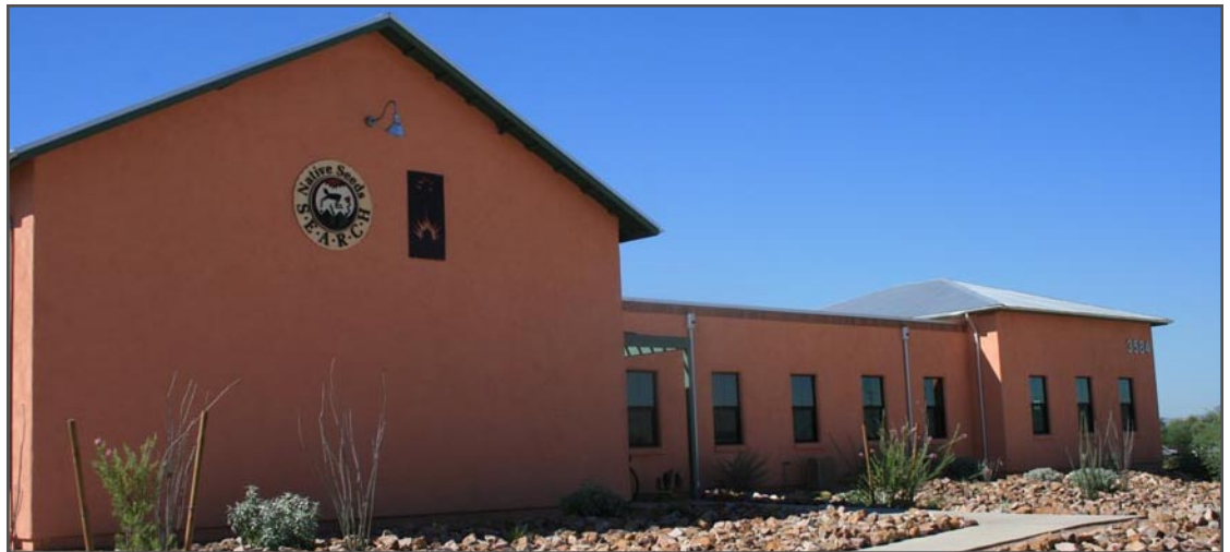
Native Seeds/SEARCH's new Agricultural Conservation Center.

Coming Up in 2011 Give the Gift They'll Love!